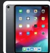
Tablet or iPad